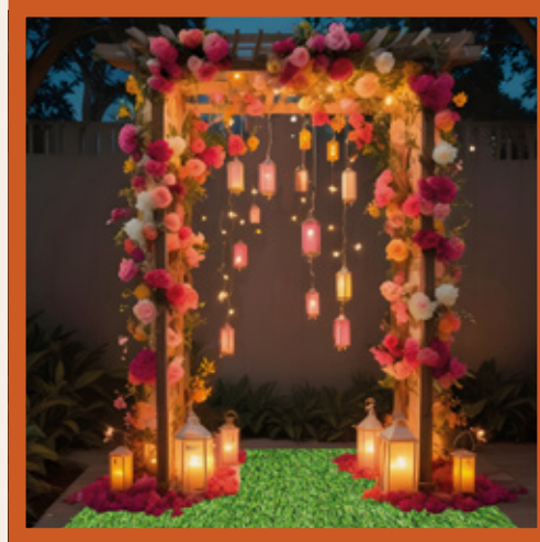
Diwali Light Arch

| With lanterns, flowers and lights create the perfect Diwali photo opportunity