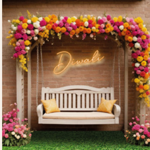
Diwali Swing Bench

| A perfect fit for any Diwali event with the option for a neon sign