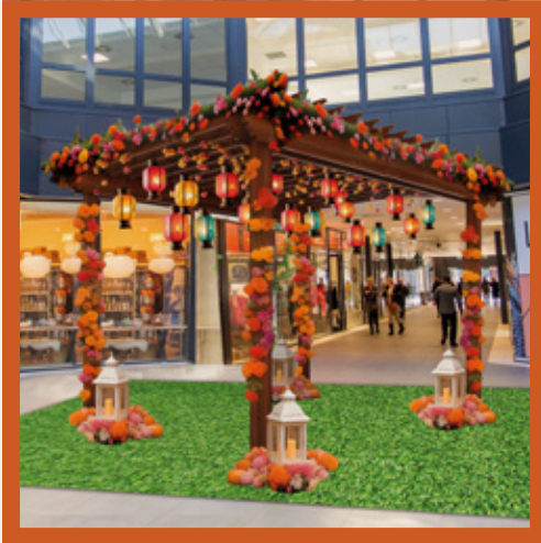
Diwali Decorated Pagoda

| Celebrate in grandeur with our exquisitely decorated pagoda