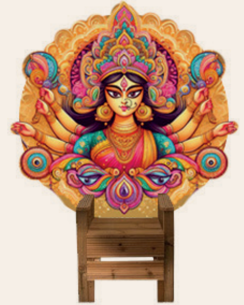
Diwali Wooden Throne

| Perfect centre piece for a pop up park, photo opportunity and Diwali event